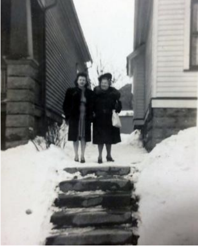
Staircase all shoveled at 828 E. Linus St. in Bay View

Businesses and schools were re-opened by the next Monday, and full transit resumed service by Wednesday, although the side streets wouldn't be cleared until March. The total financial hit in lost wages and economic activity was 75 million dollars ($800 million in today's money). There were five deaths reported.